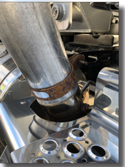
OEM VERSION - 6 MONTHS

Exhaust elbow clamp - replaces the zinc coated OEM part LP55563, 21262AA with a high-quality premium stainless steel version. Sold individually. Hardware included.